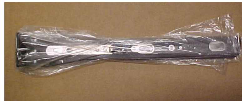
Figure 1.1 Rack-mounting kit.